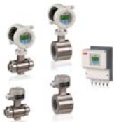
ABB – Unrivalled in its Scope and Applications Expertise.

Microprocessor-based circuitry supports automated diagnostics for sensor and electronics, MODBUS, 4-20 mA output, dual set points, keypad user interface, LED status lights and variable heater power. All welded sensors, Class I, Div. 1, flameproof enclosures, local displays with easy installation & low maintenance. Applications include hydro-carbon/water interface detection, pump seal protection, etc.