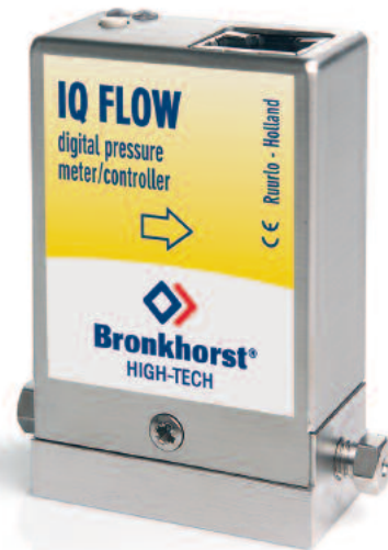
IQP-700 Pressure Controller (Picture scale 1 : 1)