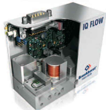
Example of customised manifold solution with Flow / Pressure Control