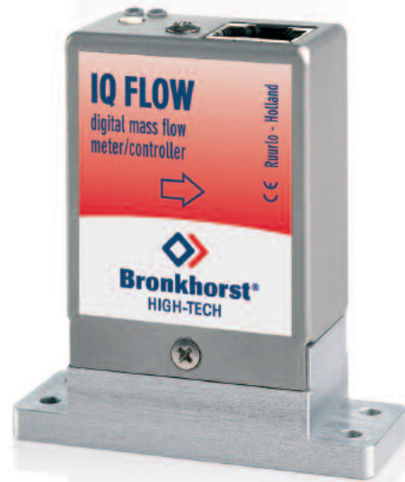
IQF-200 Downported Mass Flow Controller (Picture scale 1 : 1)